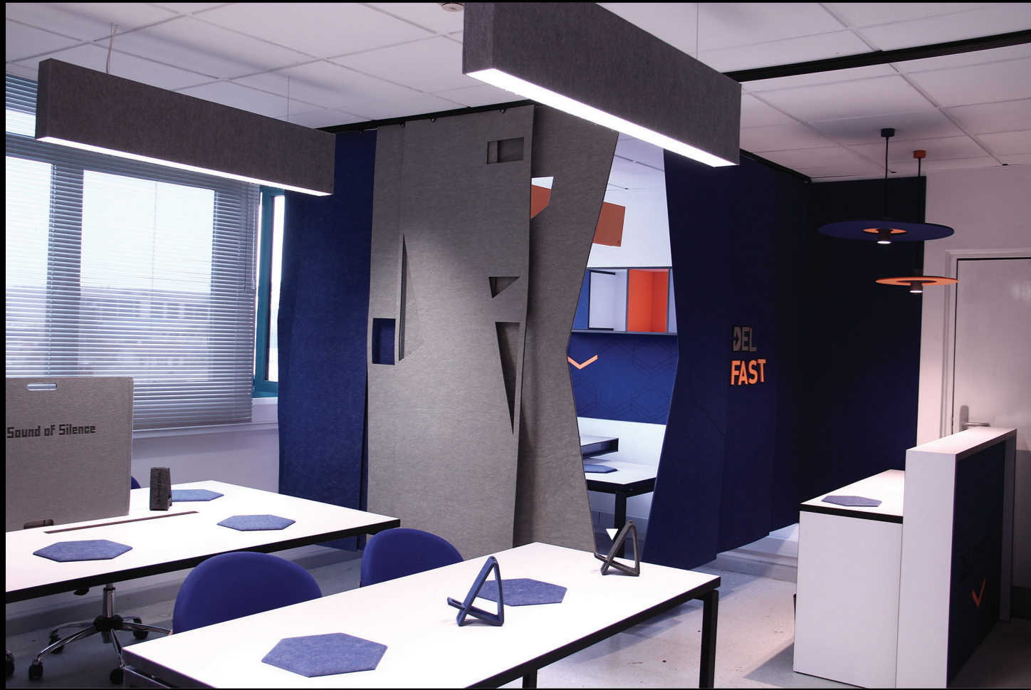
House of Innovation and Technology, Kenya, in collaboration with Namad Studio ▼ ▲ Delfast Office, Kenya, In collaboration with Namad Studio