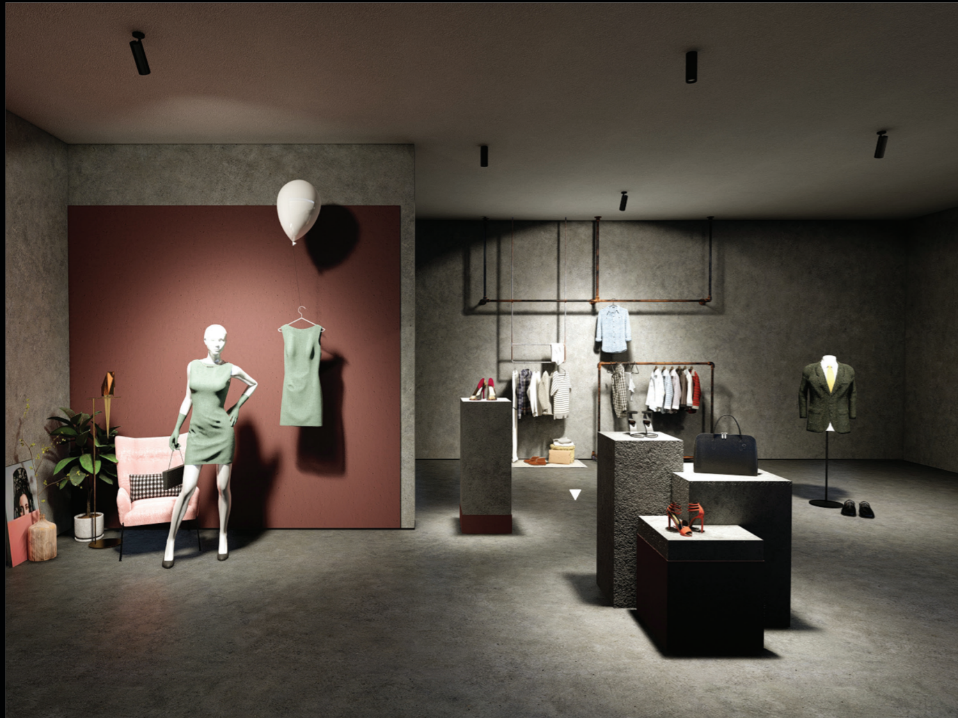
▲▼ Hana Bouitque Hotel / Architect: Persian Garden Studio