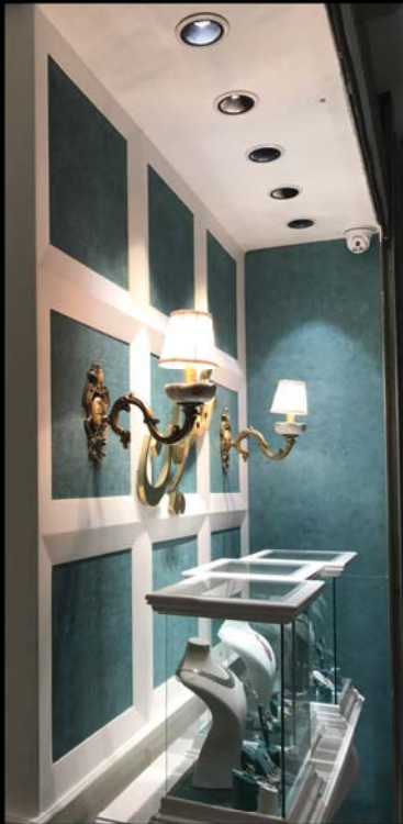
▼ Alborz Ceramic Showroom