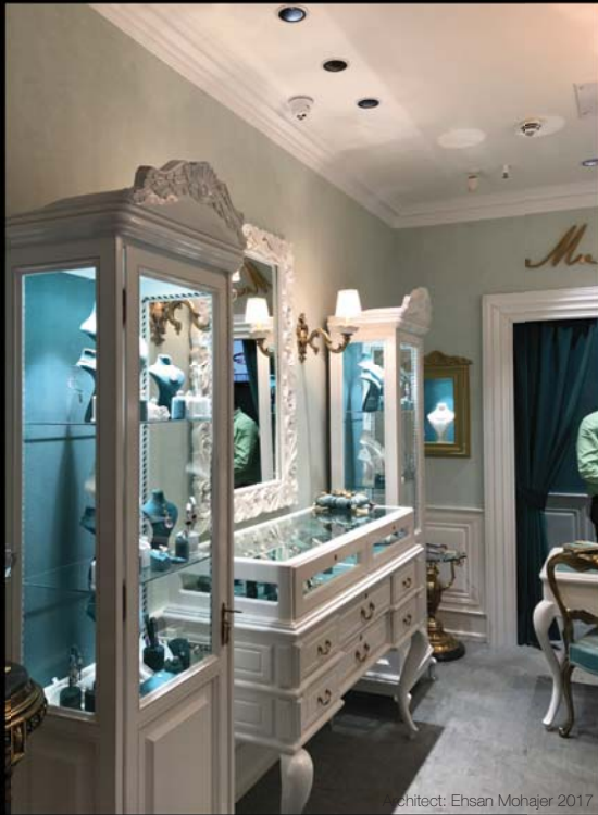
Mozafarian Jewellery Mozafarian Jewellery ▲