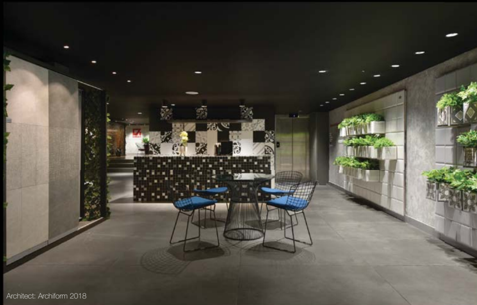
Architect: Archiform 2018