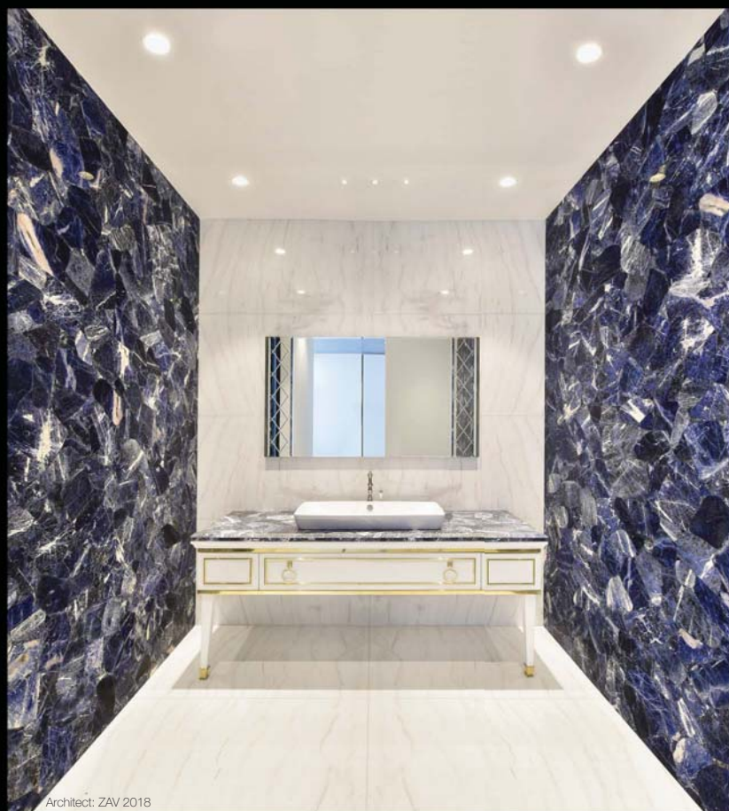
Architect: ZAV 2018