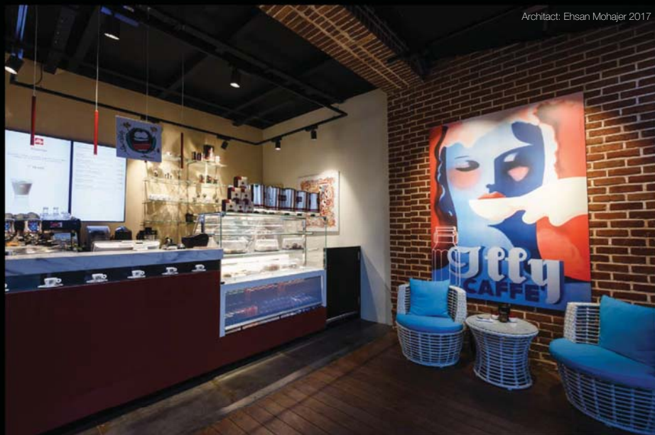
Architect: Ehsan Mohajer 2017