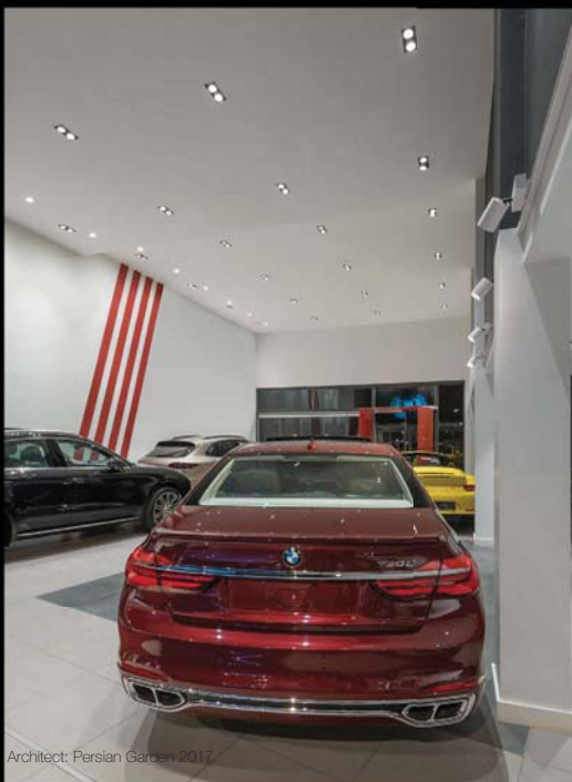
Architect: Persian Garden 2017