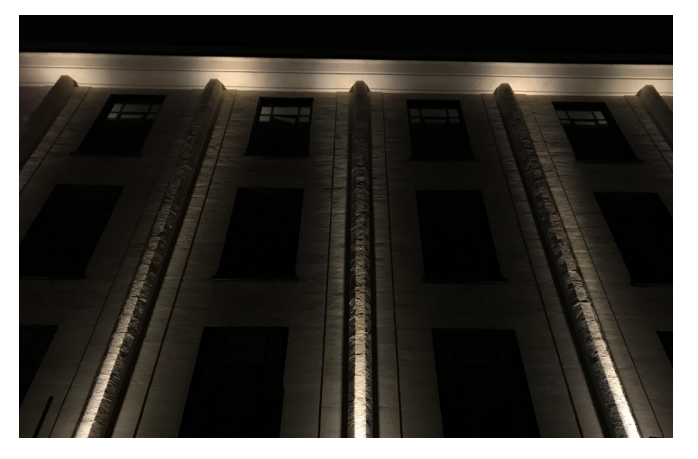
High lighting columns in historical buildings gives them a sense of drama and emphasizes the size of dimensions of the building.

Vertical elements in exterior environments can be highlighted if they are illuminated with narrow beam up lights. Finding a right light source for vertical element of more than 6m, is a common challenge since it becomes very difficult to provide uniform lighting along the element. Vaswa Maxi XS is equipped with an advanced high end optic which generates an extreme narrow beam of light. Perfect solution of illumination of vertical columns and high trees like palm. Due to this specific lens, there is almost no spill light and the the luminaries is very efficient and it has very low energy consumption.