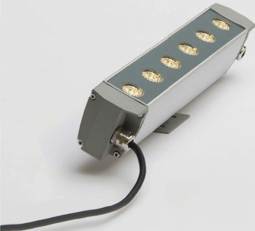
Continuous Linear light with 60 mm light emitting width